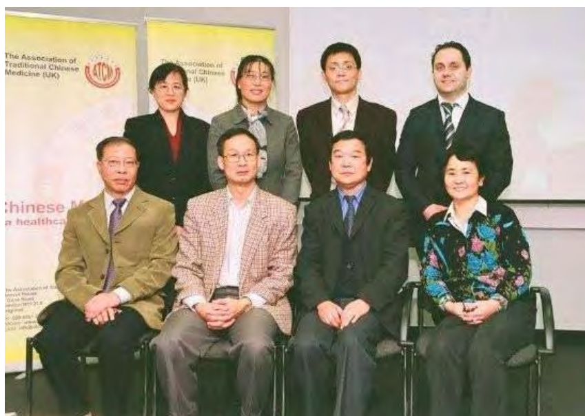
后排从左至右 Rear row from left to right: